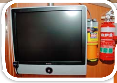
Right: The Luhrs sleeps a crew and the vee-berth converts to an owner's double. Above inset: Flatscreen TV is a neat fit and out of the way.

But with a bluewater heritage, the owner has taken his boat to Lake Macquarie and Port Stephens. With its twin engines and bluewater performance, the Luhrs 31 Open is a handy coastal cruiser. And you can fish from it. What else do you need?