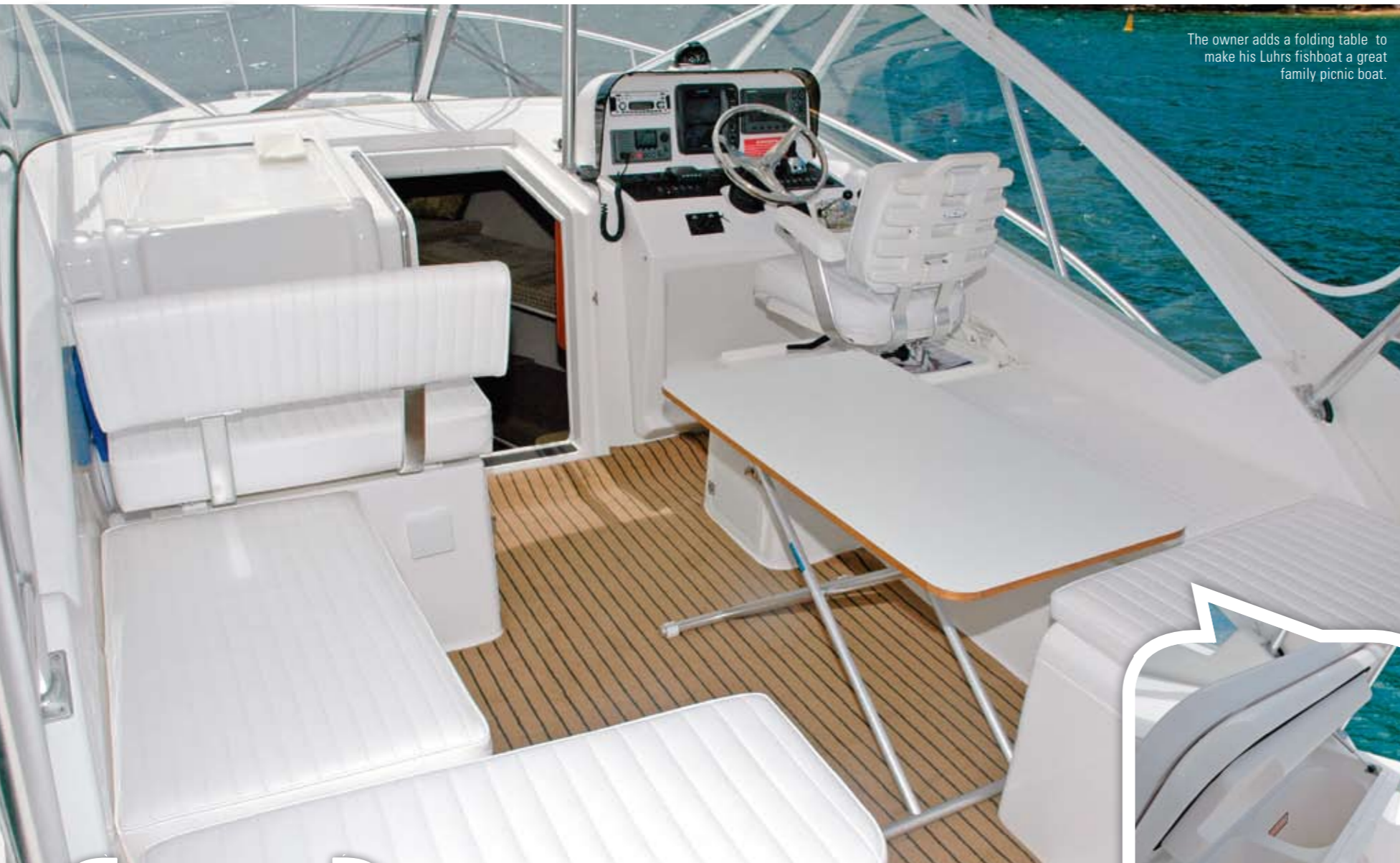
The owner adds a folding table to make his Luhrs fishboat a great family picnic boat.