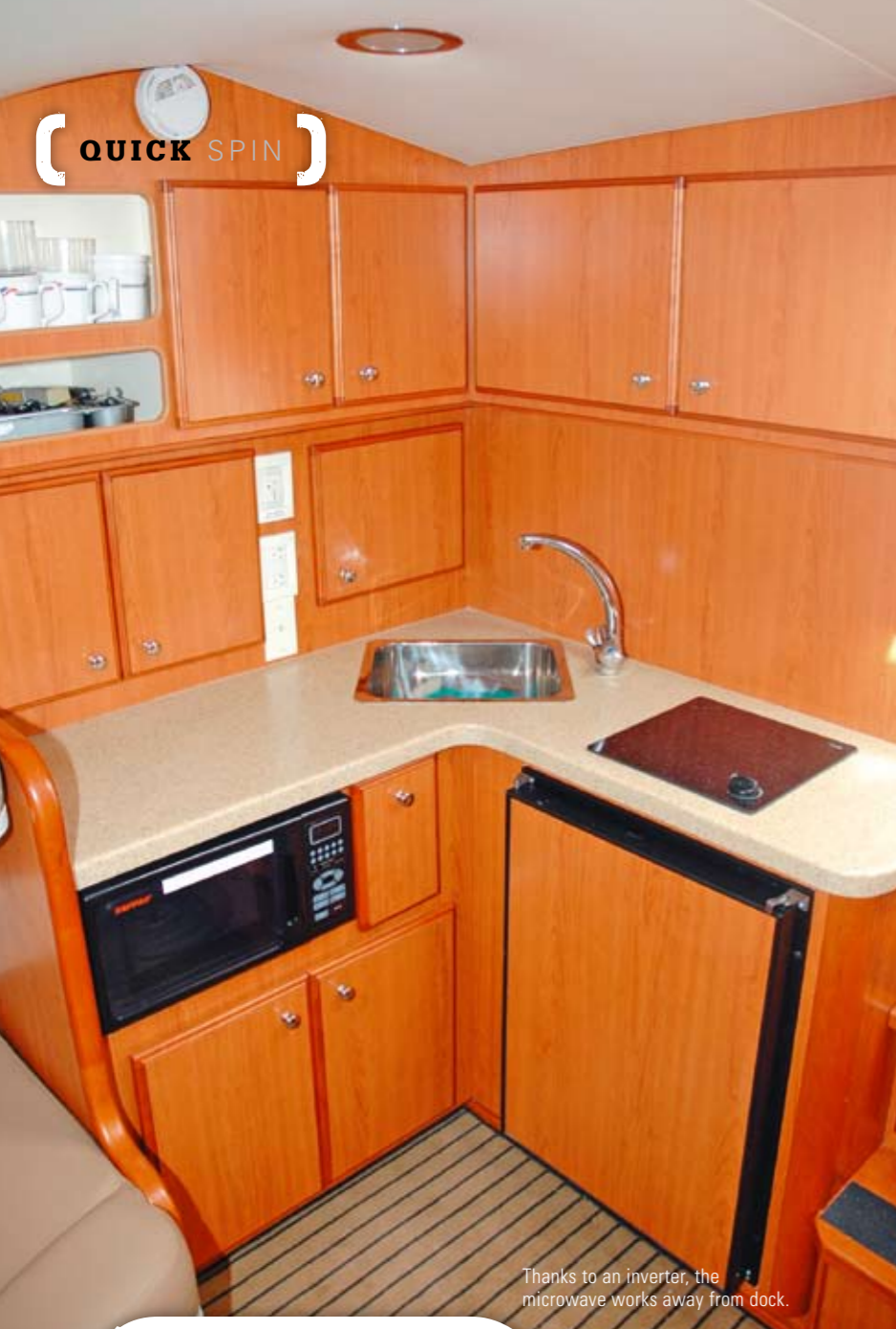
Thanks to an inverter, the microwave works away from dock.