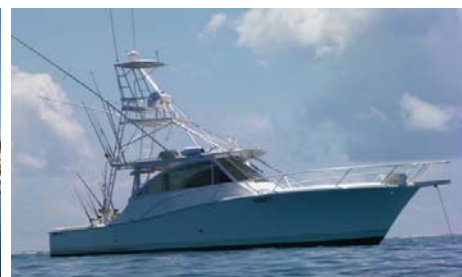
The Rat Bag crew; tinted windows & 3 air-con units keep the tropical heat at bay; a handsome boat from any angle.