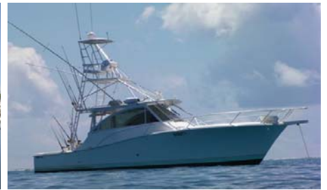
The Rat Bag crew; tinted windows & 3 air-con units keep the tropical heat at bay; a handsome boat from any angle.